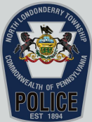
Calls for Service