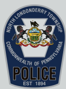
Calls for Service